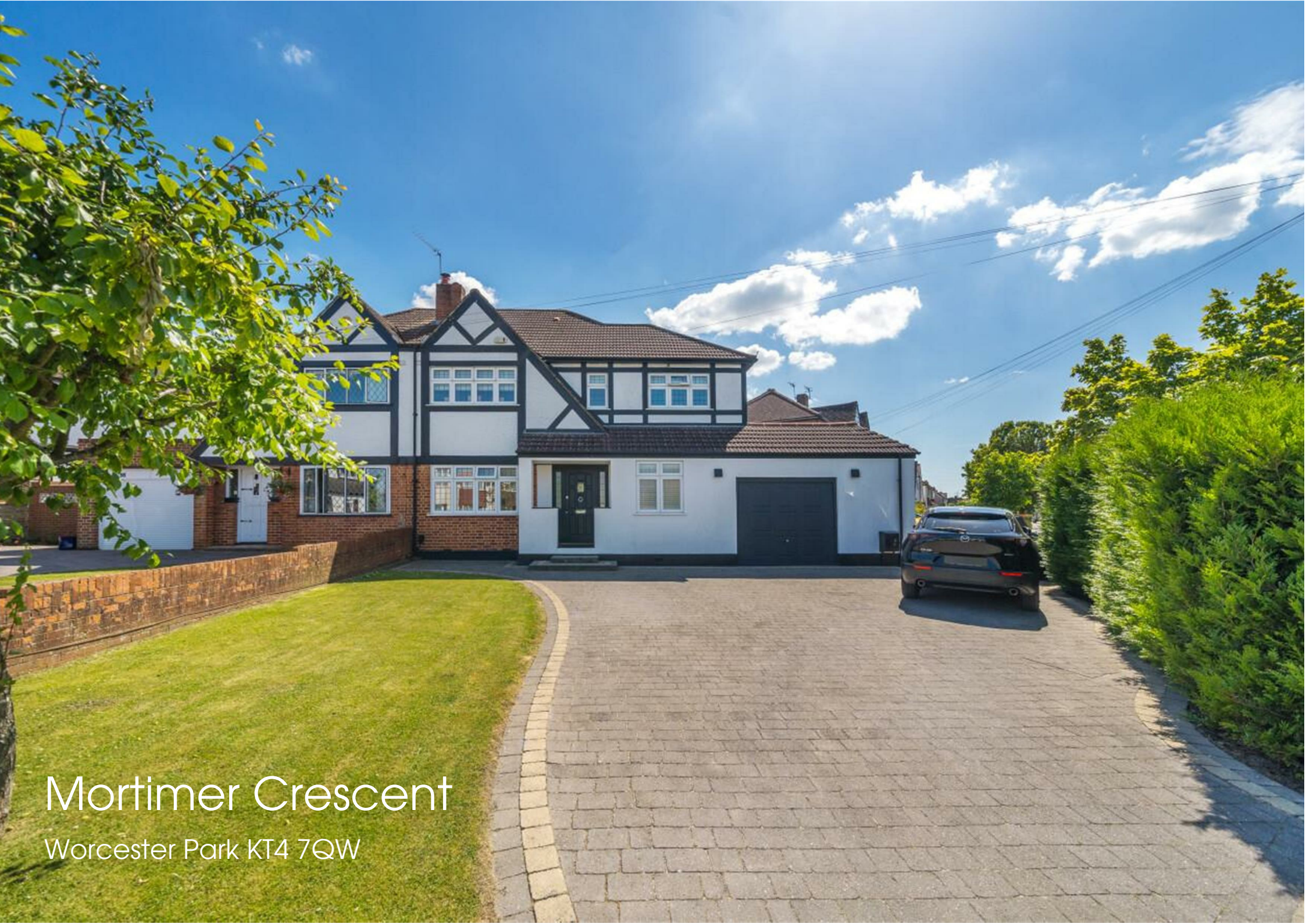
Mortimer Crescent Worcester Park KT4 7QW